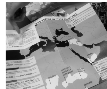
Map on forced migrations

giving visibility to transnational biographical experiences gains relevance in a Europe currently marked by social, economic and political crises