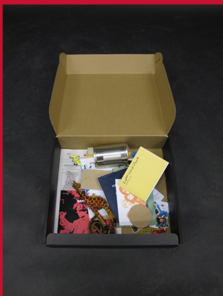
Pedagogical Kit © EAAA

#ECOS exílios, contrariar o silêncio: memórias, objetos e narrativas de tempos incertos documento#003