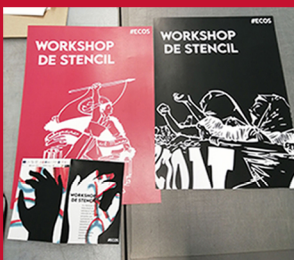
Stencil workshop