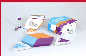
Board game