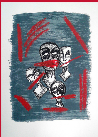
Screenprint © EAAA